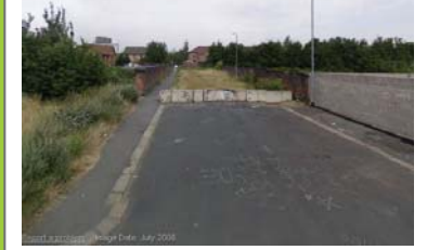
Cross Green Lane